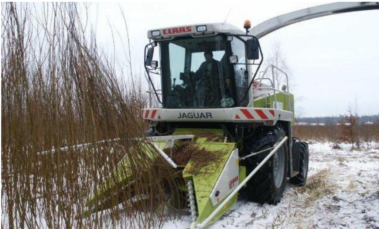
Figure 6. Mechanical harvesting of energy willow ( Salix viminalis L.).