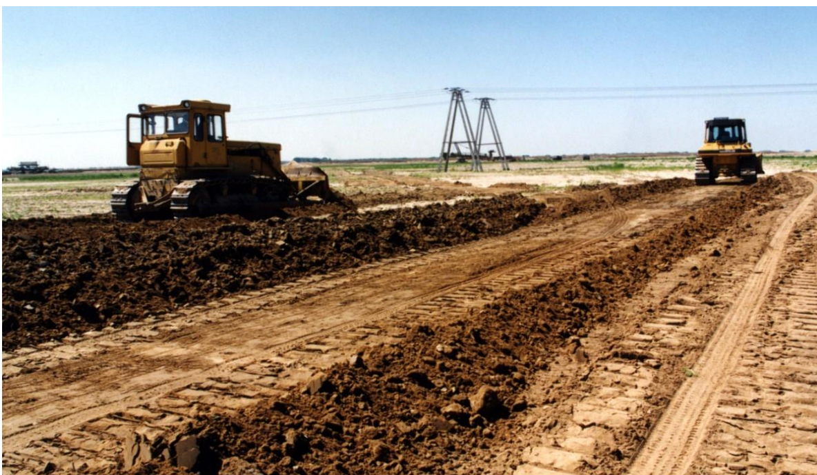
Figure 1. Technical reclamation of the internal spoil heap of the Józwin open-pit mine.

(Based on: Kasztelewicz, 2014; Psotová, 2023; Kivinen, 2017; Cinar & Ocalir, 2019; Pavloudakis et al., 2009).