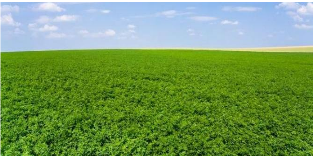
Figure 3. Cultivation of alfalfa ( Medicago sativa ).

Fodder and grazing reclamation is agricultural reclamation aimed at producing hay, silage, pasture, or feed crops for livestock such as cattle, sheep, goats, or horses. This category is still part of the food chain because contaminants may move from soil to forage, from forage to animals, and then into milk, meat, or other animal products. Compared with vegetable or direct food-crop production, grassland and pasture reclamation may sometimes be more suitable for young or marginal reclaimed soils because perennial cover reduces erosion, improves organic matter inputs, supports microbial activity, and stabilizes the surface. A 40-year retrospective study in Romania found that pasture and natural grassland covers significantly improved soil quality in abandoned mine lands, including microbial activity and nutrient status (Buta et al., 2019).