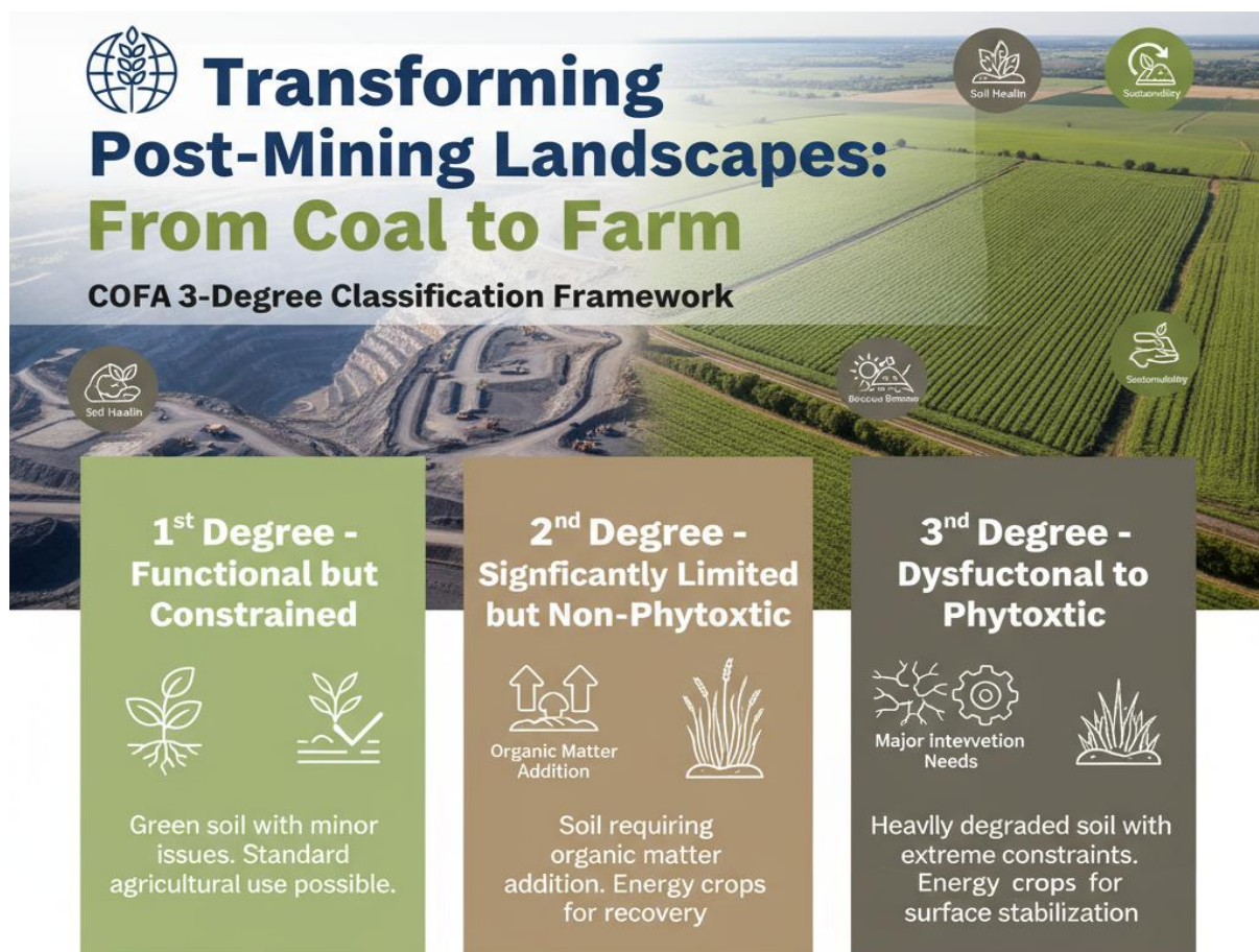
Figure 8. Soil Dysfunction Classification Framework developed within the COFA project .

In the COFA 3.2 Report , the main soil dysfunctions were grouped into five principal categories. Physical dysfunctions included erosion, soil compaction and disruption of soil structure. Hydrological dysfunctions included infiltration disruption and decreased water retention capacity. Chemical dysfunctions included unfavourable chemical conditions, with particular attention to acidification and salinization. Contamination was treated as a separate category because pollutants may create specific risks for soil, water, vegetation, food/feed production and human or animal exposure. Biological dysfunctions included nutrient deficits, loss of organic matter and loss of soil organisms. In addition, the COFA 3.2 Report recognised that post-mining degradation may also include forms of land degradation beyond soil dysfunctions, such as landform instability, altered landscape structure, loss of previous land-use functions and limitations for future land development.