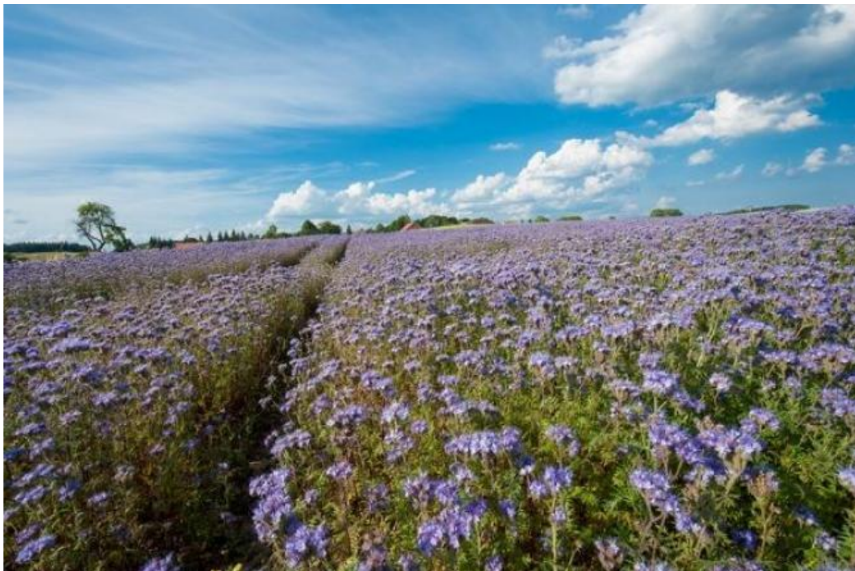
Figure 7. Cultivation of phacelia ( Phacelia tanacetifolia Benth.) as a catch crop.

Transitional agricultural reclamation uses temporary vegetation or crops to build soil before final land use is attempted. This may include legumes, grasses, grass-legume mixtures, cover crops, green manure, or early successional vegetation. In mine-land reclamation, nitrogen-fixing legumes, grasses, herbs, and trees are frequently used because they stabilize soil, add organic matter, improve nutrient cycling, and support microbial recovery. This category is important because young technosols or mine spoils may not be immediately suitable for intensive agriculture. A staged approach - first stabilization, then soil-building vegetation, then controlled agricultural use - is more scientifically defensible than immediate food production on newly reclaimed land (Maiti, 2022; Sheoran et al., 2010; Boldt-Burisch et al., 2015).