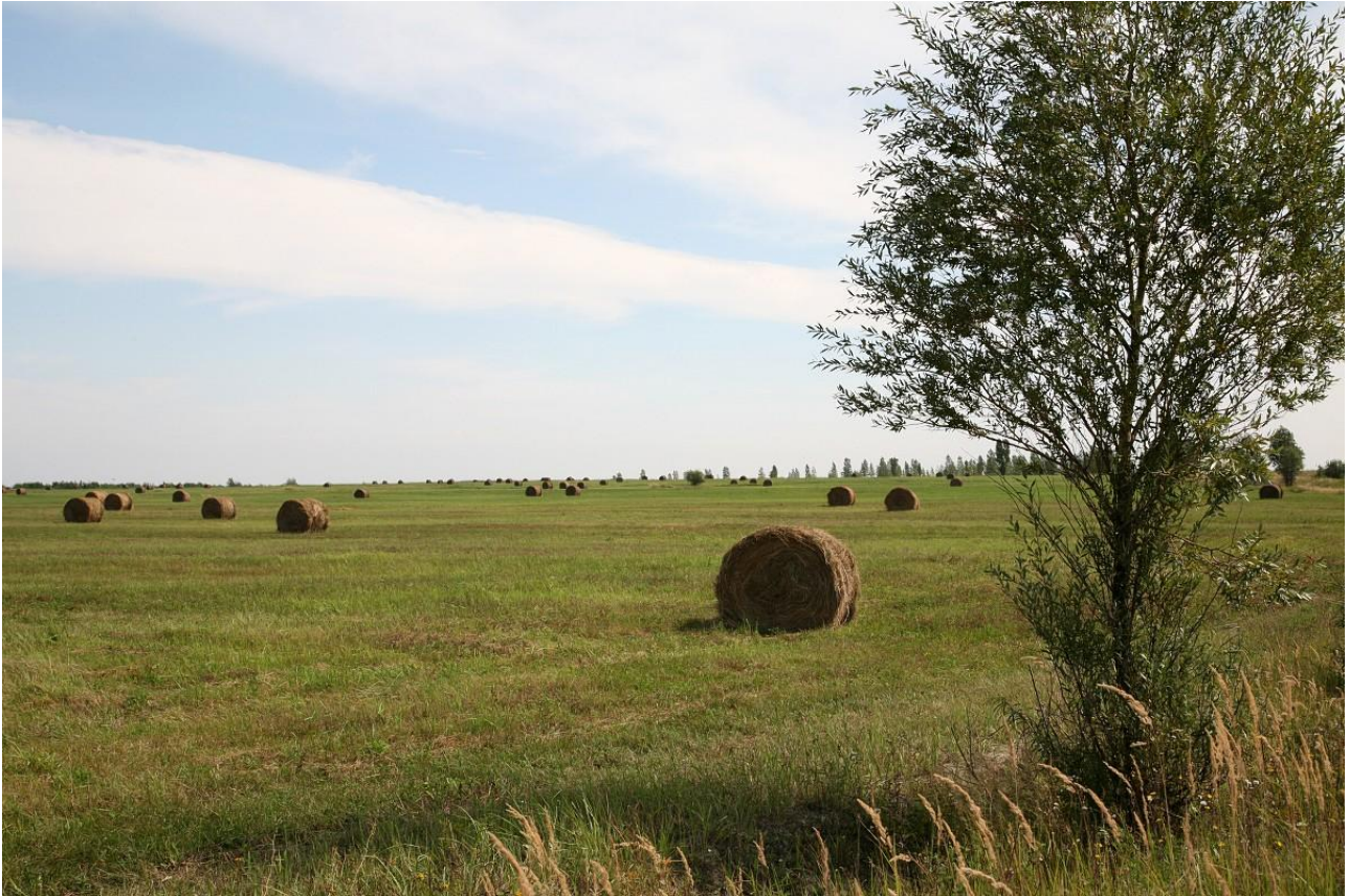
Figure 9. Agricultural reclamation of the summit area of the external spoil heap of the Lubstów open-pit mine.