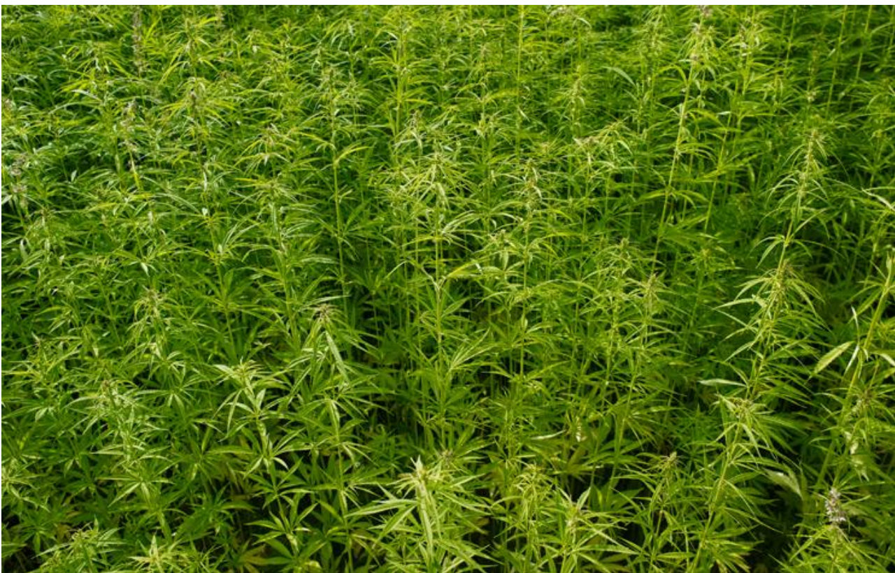
Figure 4. Cultivation of industrial hemp ( Cannabis sativa L.).

Industrial-crop reclamation uses reclaimed land to produce non-food biomass for fibre, oil, construction materials, bio-based products, or other industrial uses. Examples include Industrial hemp ( Cannabis sativa L.), Flax ( Linum usitatissimum L.), fibre crops, aromatic crops, oil crops cultivated for technical applications, and other non-edible industrial crops.. This pathway can be useful where food production is restricted by contamination risk or low soil quality. Industrial crops can reduce food-chain risk because the biomass is not intended for direct human or animal consumption, but they still require environmental assessment. Contaminants may be transferred into harvested biomass, processing residues, combustion ash, composts, or industrial by-products, so non-food use does not automatically mean risk-free use. Reviews of phytomanagement and post-phytoremediation biomass emphasize that contaminated biomass must be managed carefully to avoid secondary pollution (Bert et al., 2026; Moreira et al., 2021; Khan et al., 2022).