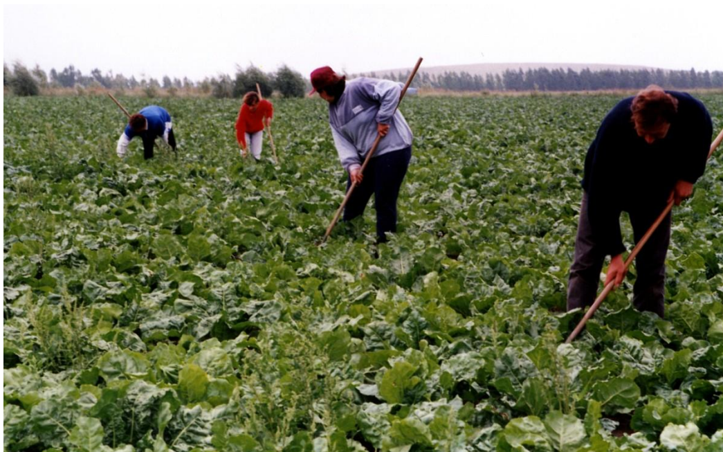
Figure 11. Sugar beet cultivation on the internal spoil heap of the Józwin open-pit mine.