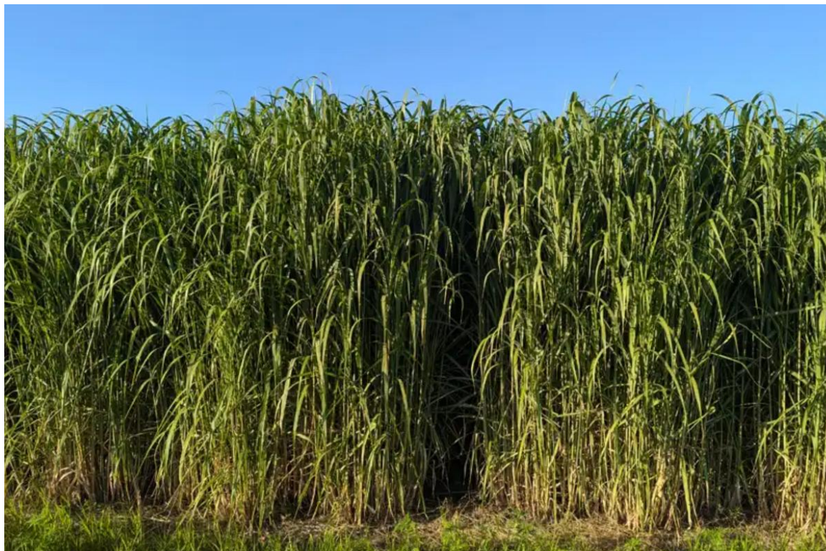
Figure 22. Plantation of giant miscanthus ( Miscanthus × giganteus ).

Miscanthus is characterized by very rapid growth, reaching heights of 3-4 m annually, together with high biomass productivity and relatively low maintenance requirements after establishment. The species demonstrates good drought tolerance and is widely used for pellet and biomass fuel production.