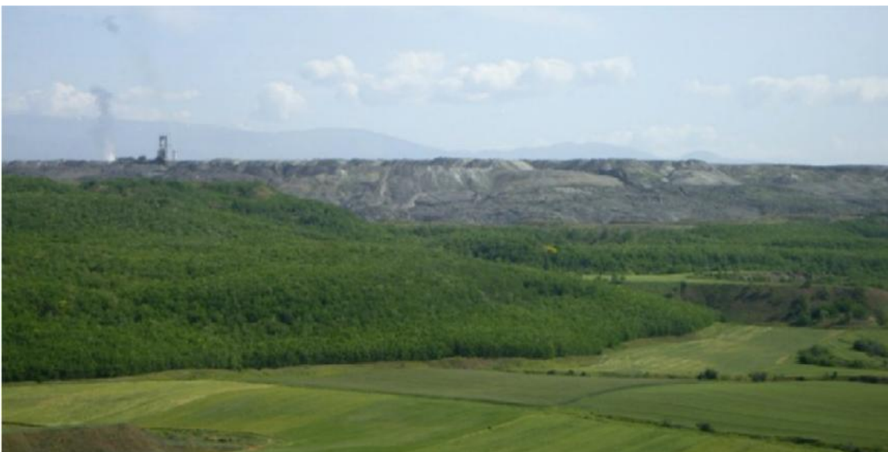
Figure 19. Robinia pseudoacacia L. plantations for slope stabilization and erosion control in Amynteon mine.

Vegetation establishment played a key role in the rehabilitation process. Large-scale plantations of Robinia pseudoacacia L. (black locust) were widely used to stabilize slopes and improve soil conditions due to their rapid growth and nitrogen-fixing capacity (Basnou, 2016). More than 1,500 hectares were reforested with average plantation densities of approximately 2,000 trees per hectare (Figure 19).