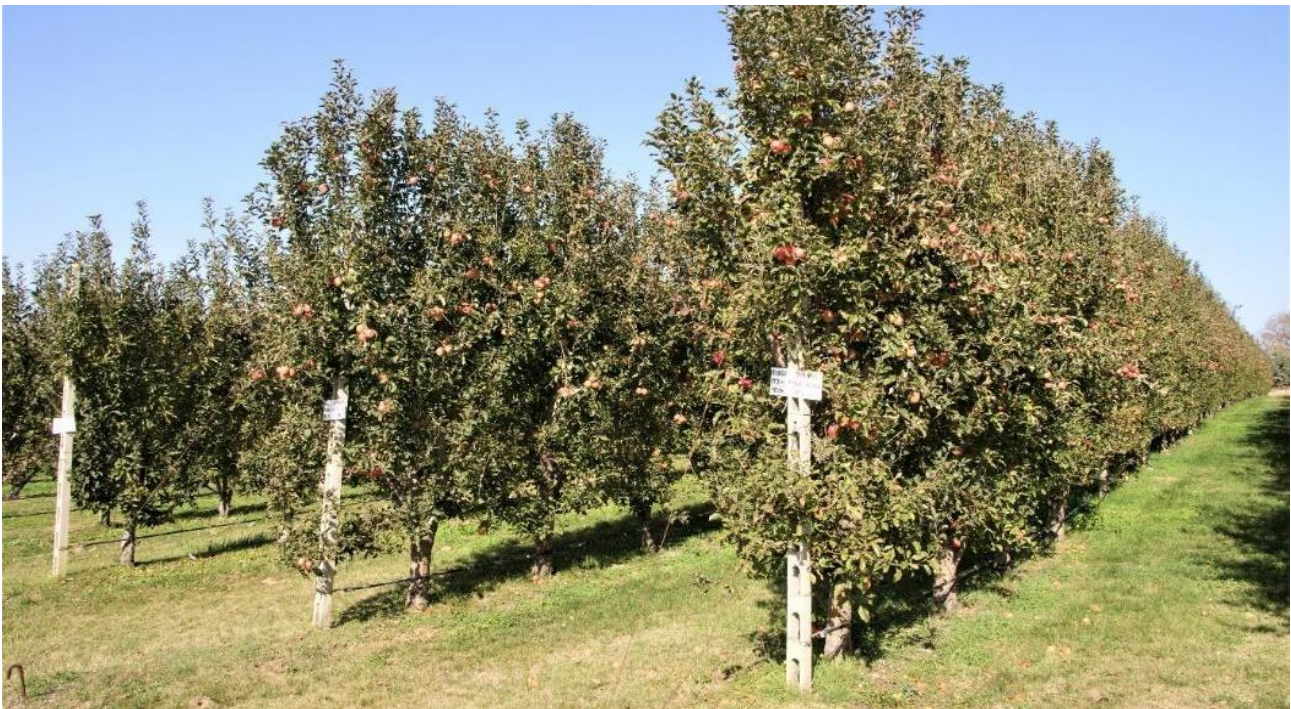
Figure 18 The orchard in the area of the Main Field mine.

The agricultural reclamation program also included the establishment of orchards containing apple, pear, plum and cherry trees, together with vineyards intended to demonstrate the potential for higher-value agricultural production systems in reclaimed mining landscapes (Figure 18) (PPC, 2009).