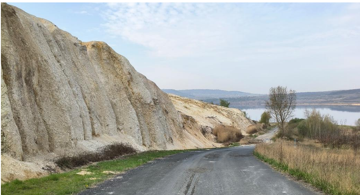
Figure 16. Lake Most (succession).

An important feature of this area is the presence of successional sites (Figure 16), which develop through natural vegetation processes without significant human intervention, particularly on spoil heap slopes and in areas with problematic soil conditions (DIAMO, n. d.). These sites may locally be burdened by residues of mining activity, including potentially toxic substances, which limits conventional reclamation approaches and highlights the importance of natural succession as a stabilizing ecological process (Euroregion Krušnohoří, 2021).