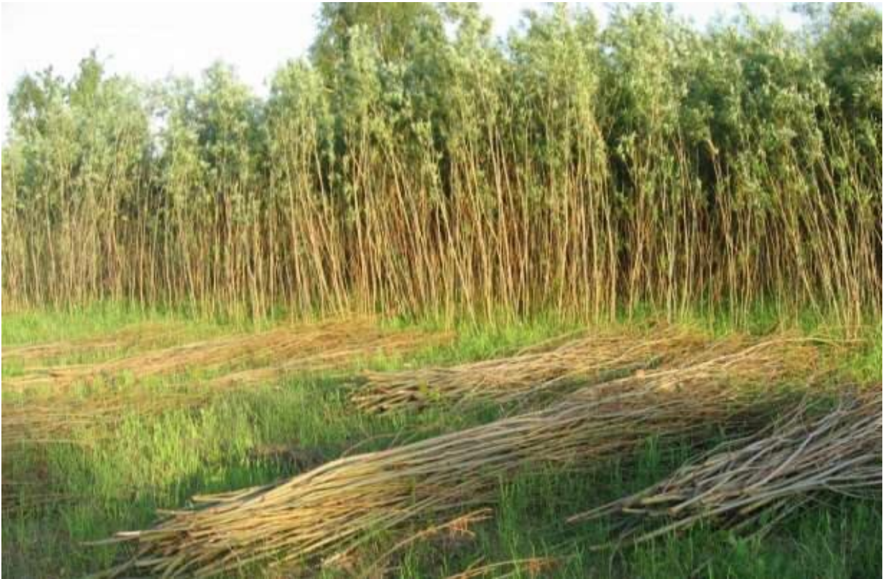
Figure 5. Basket willow ( Salix viminalis L.) cultivated as an energy crop.

frame energy crops as both a biomass-production option and a nature-based remediation strategy, but not as a universal solution (Bert et al., 2026).