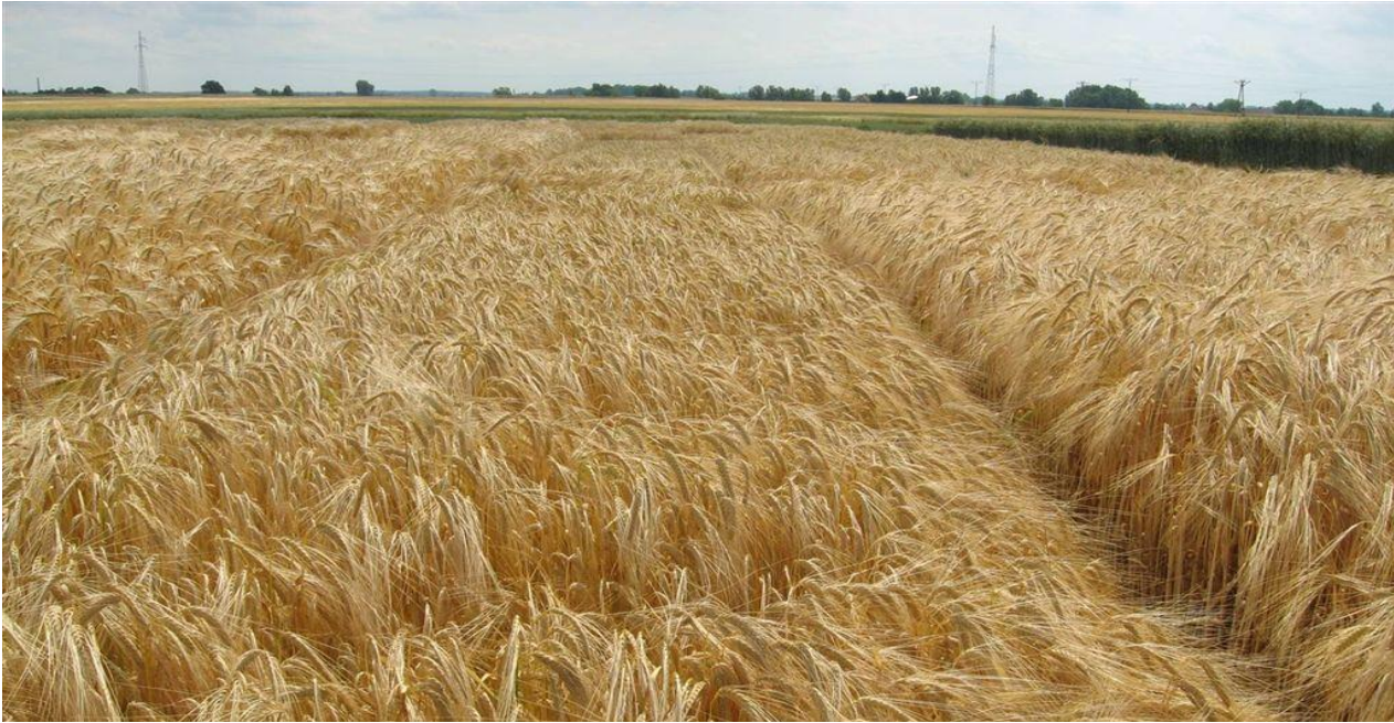
Figure 2. Barley cultivation area in the Wielkopolskie Voivodeship, Poland.