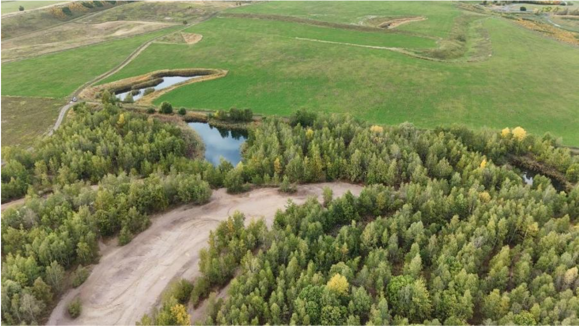
Figure 15. Radovesice XVIIA (succession).