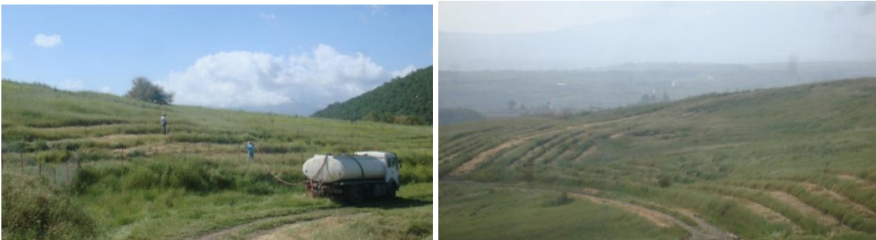
Figures 20-21. The Choremi mine plantation & maintenance works (external deposits) (Sokratidou et al., 2018).

Reclamation planning increasingly emphasizes diversified and multifunctional agricultural systems. One of the major projects implemented in the Choremi mine area involves the division of reclaimed land into ten agricultural plots supported by dedicated road infrastructure, six irrigation reservoirs and hedgerow systems designed to function as windbreaks and biodiversity corridors (Figures 20-21) (Sokratidou et al., 2018).