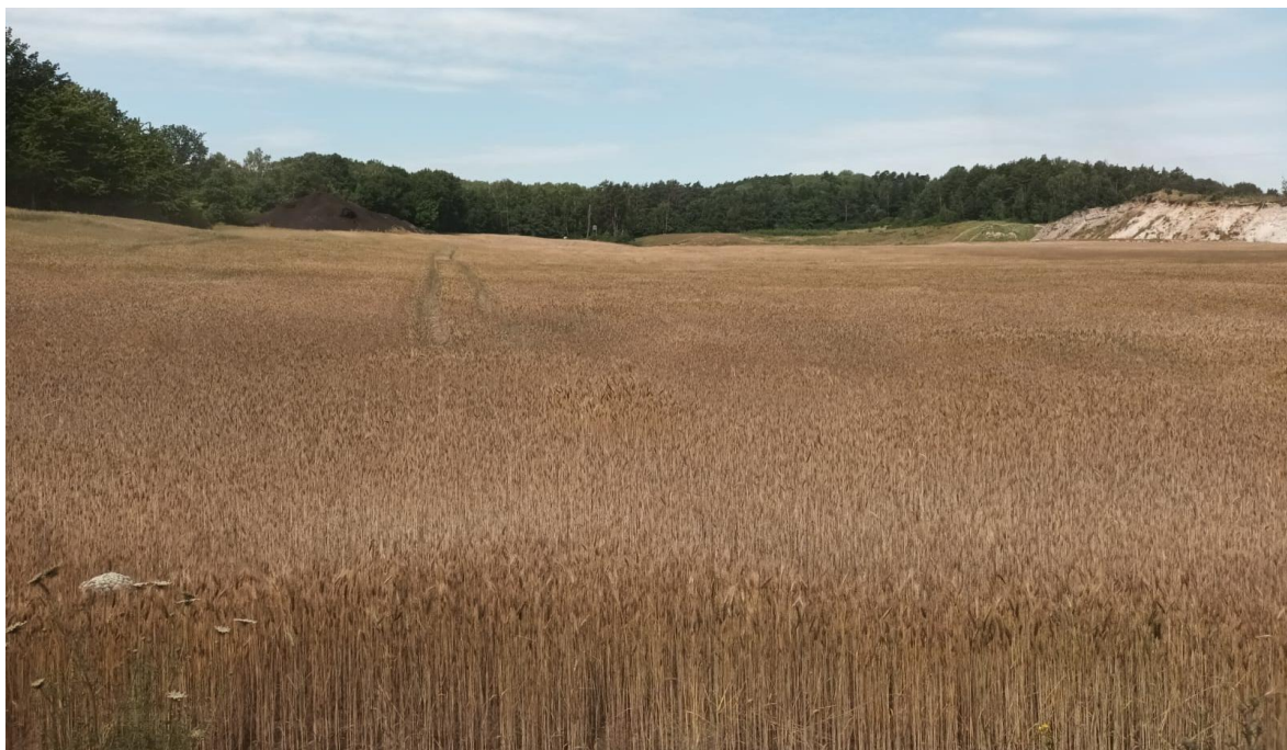
Figures 12-13. Mining area in August 2020 with active mining operations (top). The same post-mining area in November 2022 reclaimed in agricultural direction (bottom).