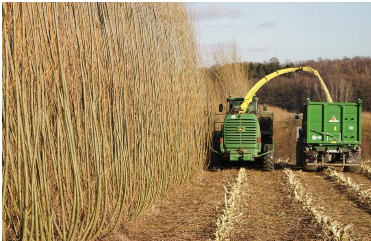
Figure 23. Harvesting of energy willow ( Salix viminalis L.).

Energy willow is one of the fastest-growing woody energy crops and is commonly cultivated in short-rotation systems. The species tolerates relatively moist soils and develops extensive root systems contributing to substrate stabilization and contaminant uptake.