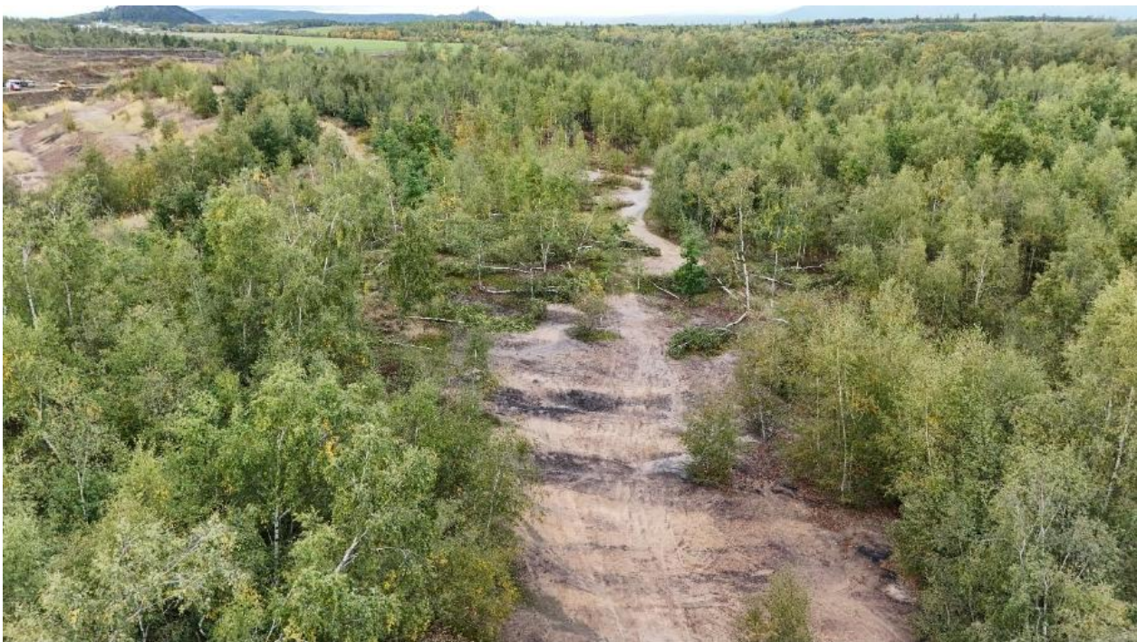
Figure 17 Střimice (succession, phytotoxic site).

Forestry reclamation dominates the reclaimed area, with agricultural reclamation represented to a lesser extent.