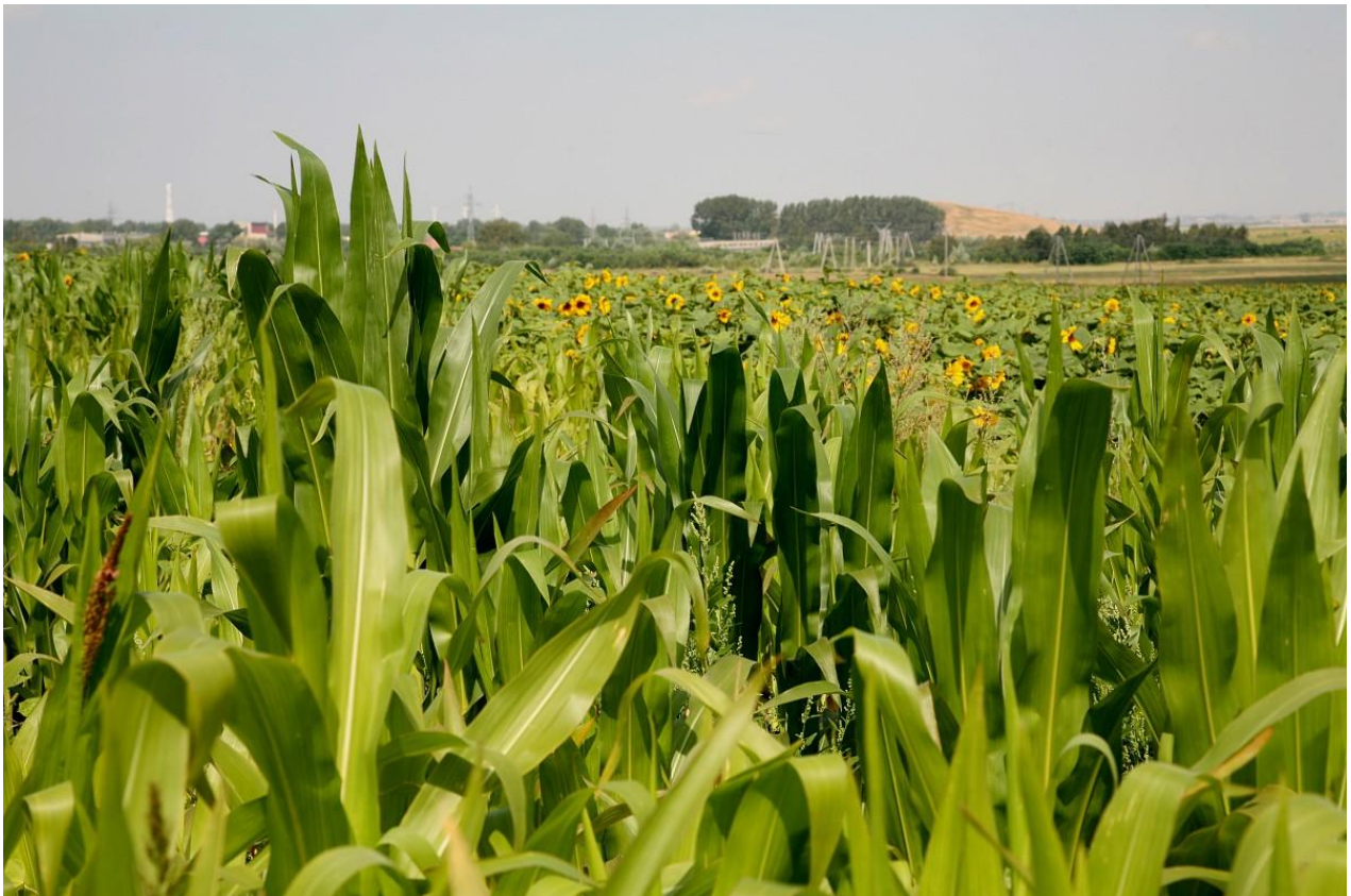
Figure 10. Maize and sunflowers cultivated on the internal spoil heap of the Józwin open-pit mine.